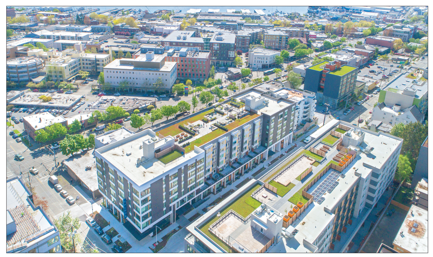
Valdok's exterior elements are influenced by northern European design.